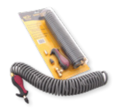
Dust Blower Kit - 120 PSI