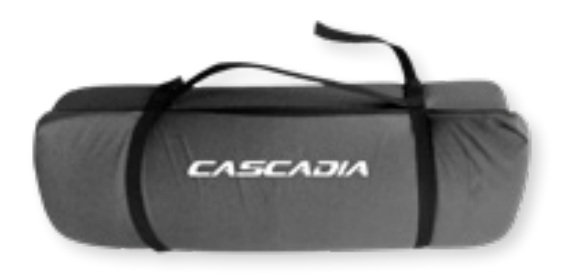
Cascadia Logo, Mattress Protector