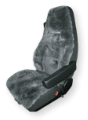
Cascadia Passenger Seat Sheepskin Seat Cover (ISRI 5030)

B64911215 • Suits: Cascadia ISRI 5030 Passenger Seat