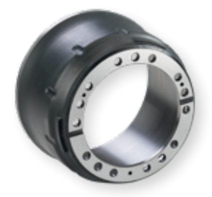
Brake Drums (Rear Axle)