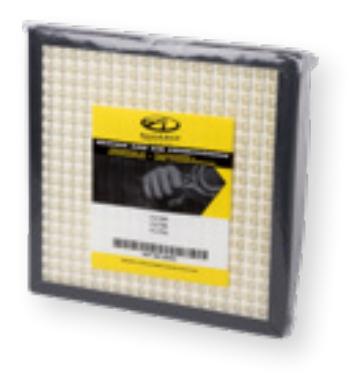
Cabin Air Filter

QABP N83328345 • Suits: All Freightliner Models