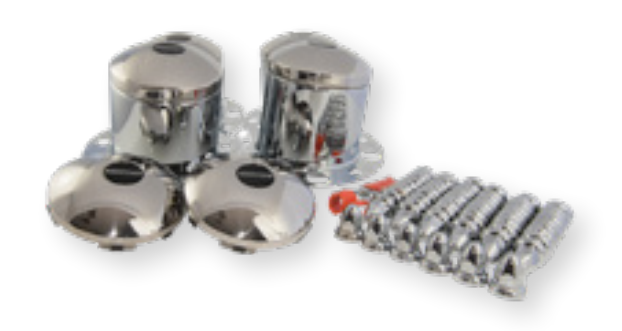
Stainless Steel Axle Cover Kit 10 Studs, 285mm