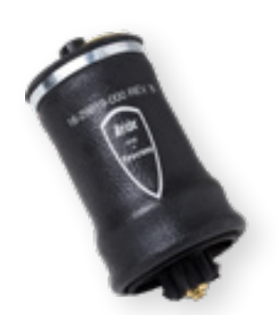
Cab Suspension Air Springs 165mm