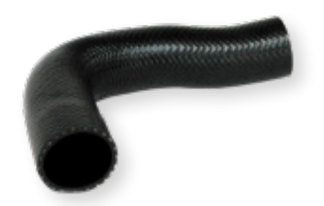
DD15 Upper Radiator Hose