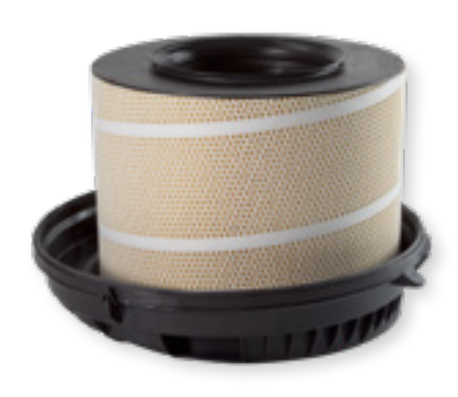
Air Filter Element