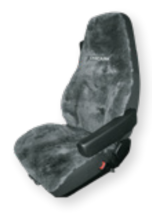
Cascadia Drivers Seat Sheepskin Seat Cover

B64911214 • Suits: Cascadia ISRI 5030 Driver Seat