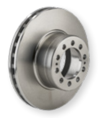
Brake Disc (Front Axle)