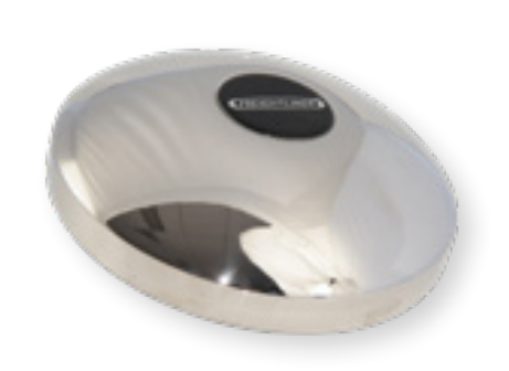
Stainless Steel Hub Caps Drive/Snap-On 8-1/8"