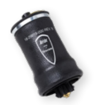
Cab Suspension Air Springs