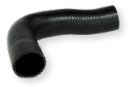
DD15 Lower Radiator Hose