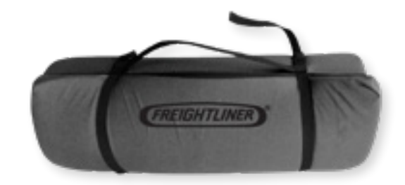
Freightliner Logo, Mattress Protector

QSCW FREMPU19575CHA • Suits: All Freightliner Models