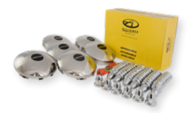
Hub Cap and Nut Cover - Stainless Steel

QABP 910311SFL6ASR • Suits: Freightliner